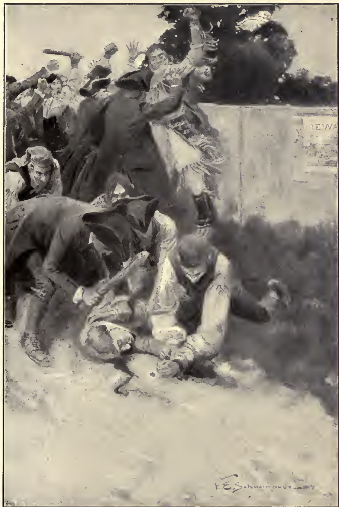
“ ‘DEATH TO THE HIGHWAYMEN’ ”